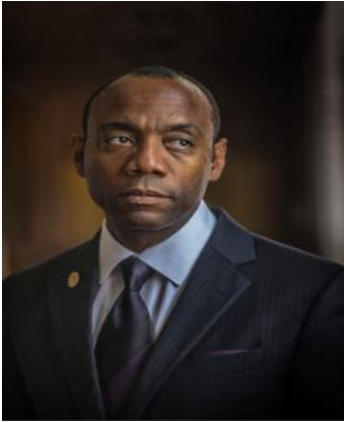
Cornell William Brooks President & CEO, National NAACP

Cornell Williams Brooks is the 18th President and CEO of the National Association for the Advancement of Colored People (NAACP). As a civil rights attorney, social justice advocate, fourth generation ordained minister and coalition builder, Brooks exemplifies the mission of the NAACP to secure political, educational, social and economic equality for all American citizens. Working with the whole of the NAACP, his vision is an NAACP that is multiracial, multiethnic, multigenerational and millions of members strong.