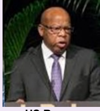
US Rep. John Lewis

Outstanding Supporting Actress in a Comedy Series.